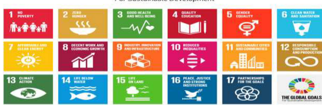
Fig 1 | The global goals for sustainable development